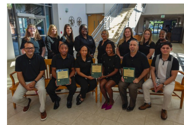
Pictured Left to Right: Manatee County, Orange City, Kissimmee

The Government Finance Officers Association (GFOA) Triple Crown Award represents one of the highest honors in public finance. This prestigious recognition is awarded to governments that achieve excellence in all three of GFOA's major award programs: the Distinguished Budget Presentation Award, the Certificate of Achievement for Excellence in Financial Reporting (ACFR), and the Popular Annual Financial Reporting (PAFR) Award.