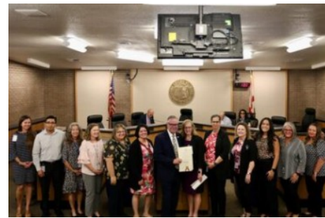
City of Fort Myers

CLICK HERE to view all of the agencies that participated and see how finance teams across Florida were recognized during Government Finance Professionals Week.