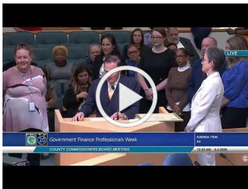
Palm Beach County Clerk of Circuit Court & Comptroller